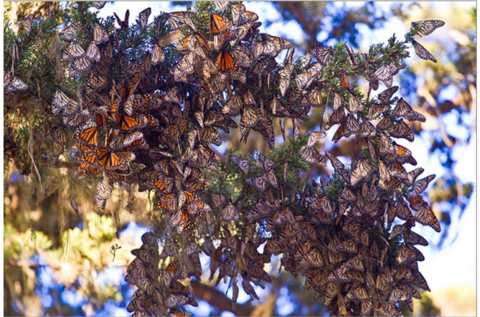
Monarch Butterflies wintering in the Monarch Grove Sanctuary in Pacific Grove, California.

The monarch's usual life cycle takes it south to Mexico in the winter and back up north towards the US-Canada border in the spring. Butterflies that stay in roughly the same place die of starvation, as neither region produces enough food to allow them to survive a year. These assumptions about butterfly migrations are only applicable if