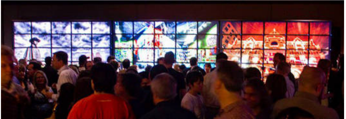
The VisLab bridged art and technology in the first installment of the “Exploring Creativity in Digital Space” exhibition series.

TACC launches new event series to showcase digital media at extreme scales