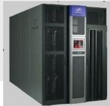
STK SL8500 Tape Lib