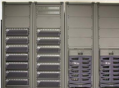
DDN S2A 9900 Disk